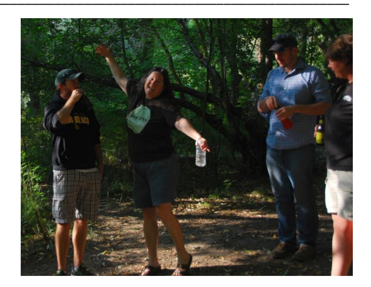
Are we having fun yet? YES!!!